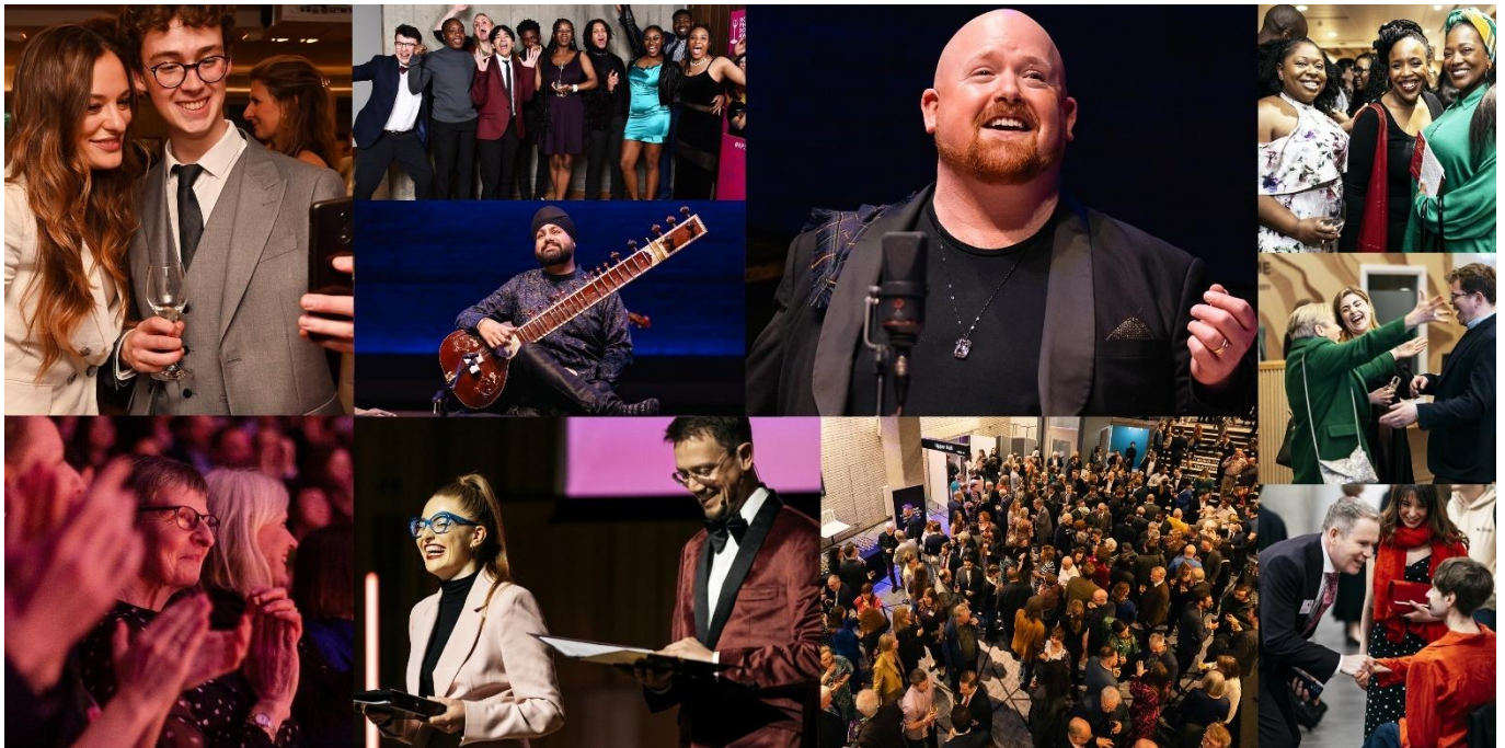
Scenes from recent RPS Awards

Many such supporters (though not all) attend the RPS Awards event and we hope you will have the chance to meet them there. Several other organisations and individuals support other facets of the RPS Awards, or the occasion overall as Principal Supporters. We will share more details of them on our website and social media in due course.